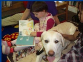
2012 Boonton Library visit